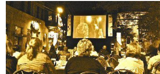
Nashua Dinner and a Movie

Dreyfuss. A delicious dinner of American Tapas will be served by Stella Blu , one of Nashua's best. Movie starts at 7 PM, dinner and beverages are served by Stella Blu off a menu and paid for separately. Event ends around 10:45 PM. (Rain Date Thurs. 4 Aug) Check out the movie website for details, tix, and directions.