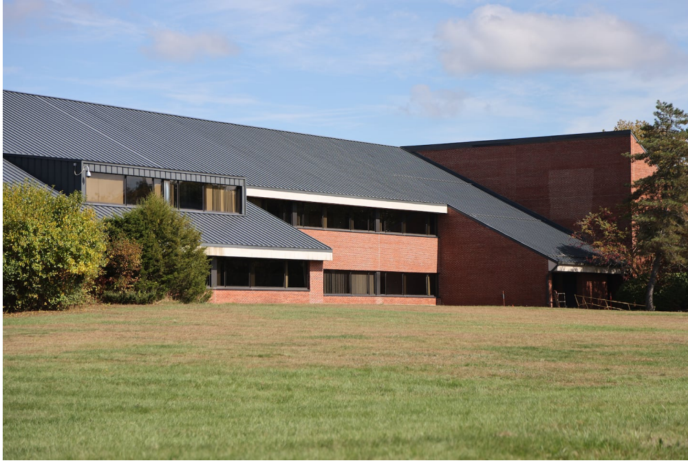
An exterior view of the former Bose property where Masters Academy will be located.

The school also plans to be sensitive to the reality that not every MAI student will graduate with the ability to make an athletic impact at the college or professional level.